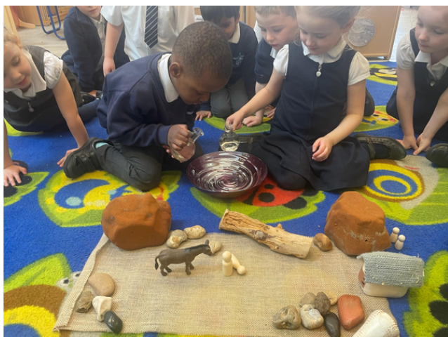
RE in Reception