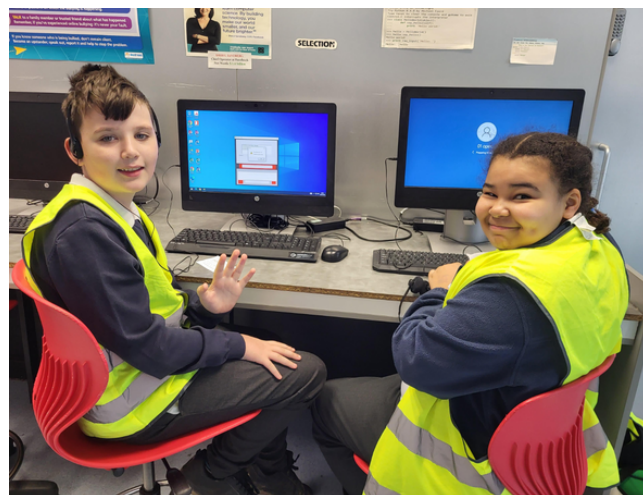
Year 6 visited Seaford Head